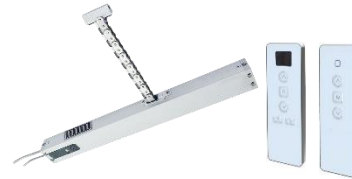
Finestra FT Motor