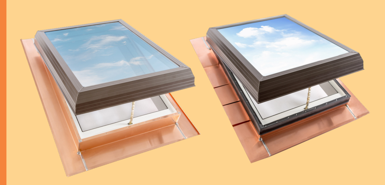
Pitched Continuous Flashing